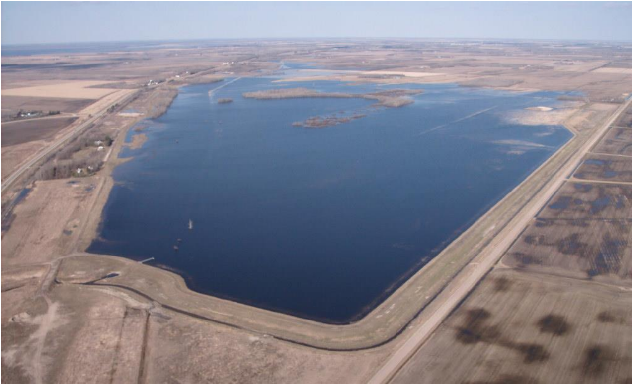
Ross #7 Impoundment During 2009 Spring Flood

Now is the time to start preparing for potential flooding. The TRWD reminds homeowners with farmstead ring dikes to check and monitor any culverts you may have through your dikes. Be sure to close the gate on the culvert prior to flooding, and make sure the gate is operable and accessible. Homeowners who are in the floodplain or near the floodplain should consider the national flood insurance program. If you live on a site that is affected by flooding, be sure to monitor conditions not only on site, but also roads that may flood and affect access to your location. Remember, “Turn Around, Don’t Drown”!